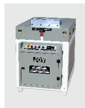
Smashing & Nipping Press