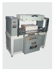
Book Spine Pre-Gluer

JOY'S experience and knowledge of book-binding acquired in the past two decades is reflected in the competence, quality standards, using indigenous inputs and dedication in search of new solutions for producing excellent finished books, magazines and stationery items through the most economical means.