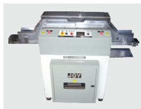
Nipping & Smashing OL