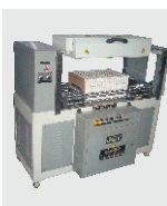
Book Spine Pre-Gluer