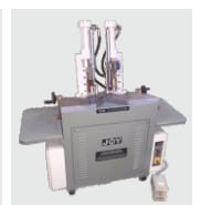
Twin Corner Cutting-II

JOY'S experience and knowledge of book-binding acquired in the past two decades is reflected in the competence, quality standards, using indigenous inputs and dedication in search of new solutions for producing excellent finished books, magazines and stationery items through the most economical means.