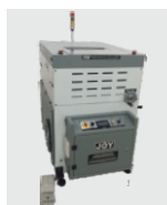
B B Rounding & Backing