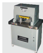
B.Three Side Trimmer