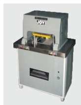
B. Three Side Trimmer