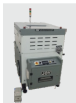
B B Rounding & Backing