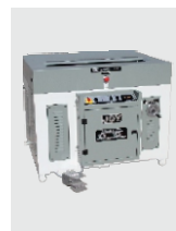
Edge Squaring Press