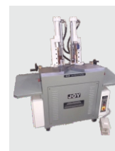
Twin Corner Cutting-II