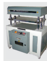
Dual Book Press